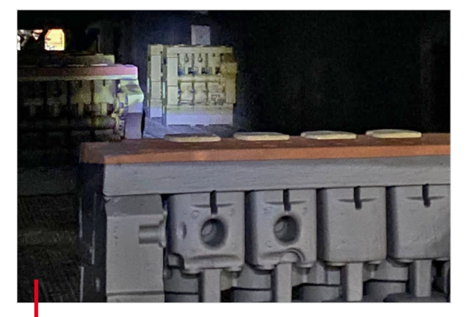
Coated engine block in continuous oven