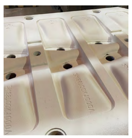
Figure 4. Homogeneous and smooth coating film. Spray gun, dipping and flow coating application.