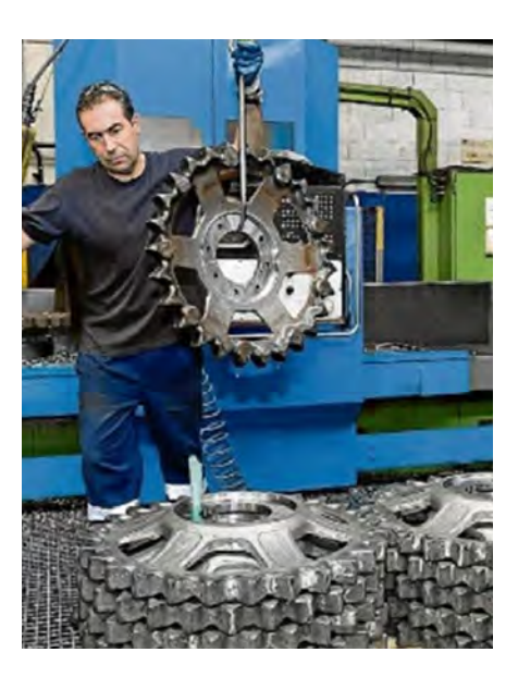
Figure 2. PYRSA manufactures high-quality steel castings for the mining, construction, high-speed rail, and agricultural sectors.

As one of its business goals, PYRSA aims to use environmentally-friendly products and materials at its facility. Faced with a new European resolution advising against the use of zircon-based refractory coatings, the company was seeking a new low-zircon or zircon-free alternative that could still deliver the same quality of casting at the same cost of production.