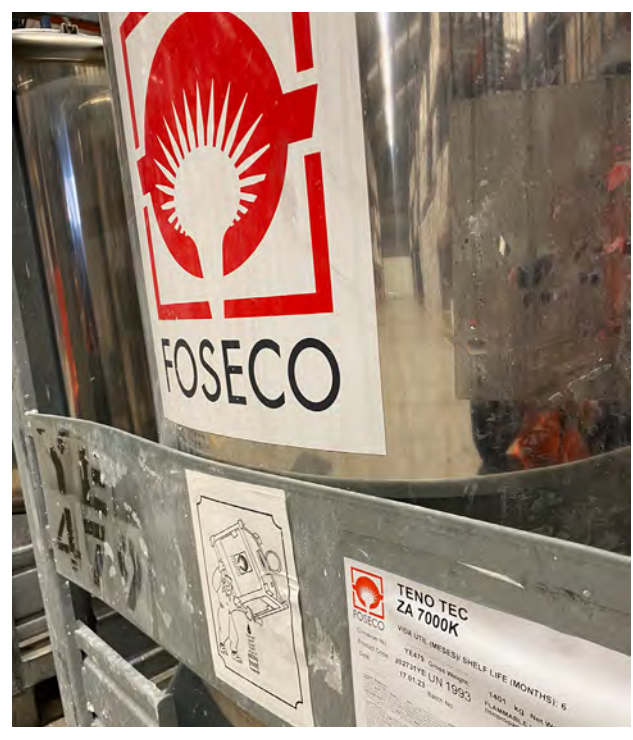
Figure 3. TENO Tec ZA 7000 K zircon-free coating used at PYRSA.

PYRSA is just one of the foundries currently working with the new zircon-free coating formulation. The need for change has been felt by many large iron and steel foundries, and there are many now using TENO Tec ZA coatings with similar good results. The specific characteristics of the TENO Tec ZA can also be adapted to the needs of the foundry and geometry of the moulds/cores, e.g., to provide greater penetration, longer draining time, and elimination of drips. Following on from the success of these solvent-based coatings, a new range of SEMCO Tec ZA water-based coatings are now available.