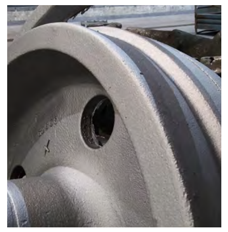
Figure 5. Excellent results in massive castings. Free of burn-on and with good surface quality