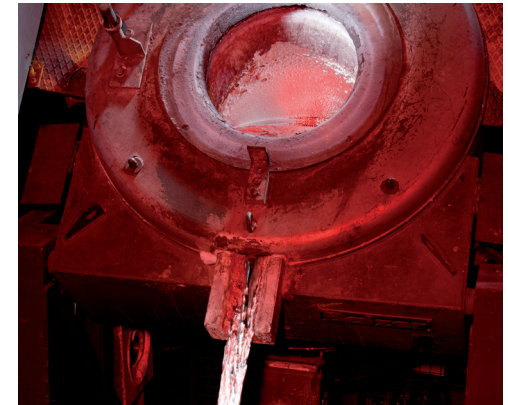
Crucibles are used for melting and holding

For detailed application information please refer to the individual product datasheets.