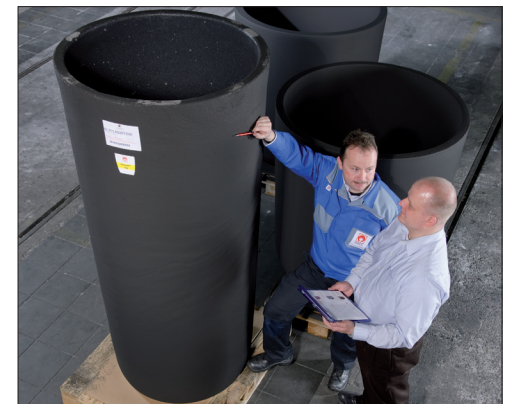
Tailor made crucibles are available